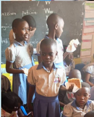
Our children with their first waffle!