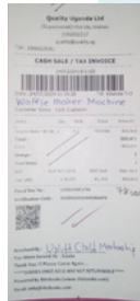
Waffle Maker Receipt