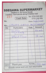
Waffle Ingredients Receipt