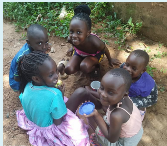
A few of our children enjoying their time outdoors

Even though I was too disabled to work, pay my rent, or even cook a meal, a question began to take root: "If I am still alive, how can I use my life for something greater? What is my purpose here on earth?" That question became the seed of hope for Happy Hüt Sanctuary. Today, because of your support, that seed has grown into a home and school where children are safe, cared for, and loved, far from the reach of traffickers! I am on the road to a healthy recovery and maintenance program with a wonderful team of nurses and doctors. Thank you for being a part of this amazing journey; we are just getting started!